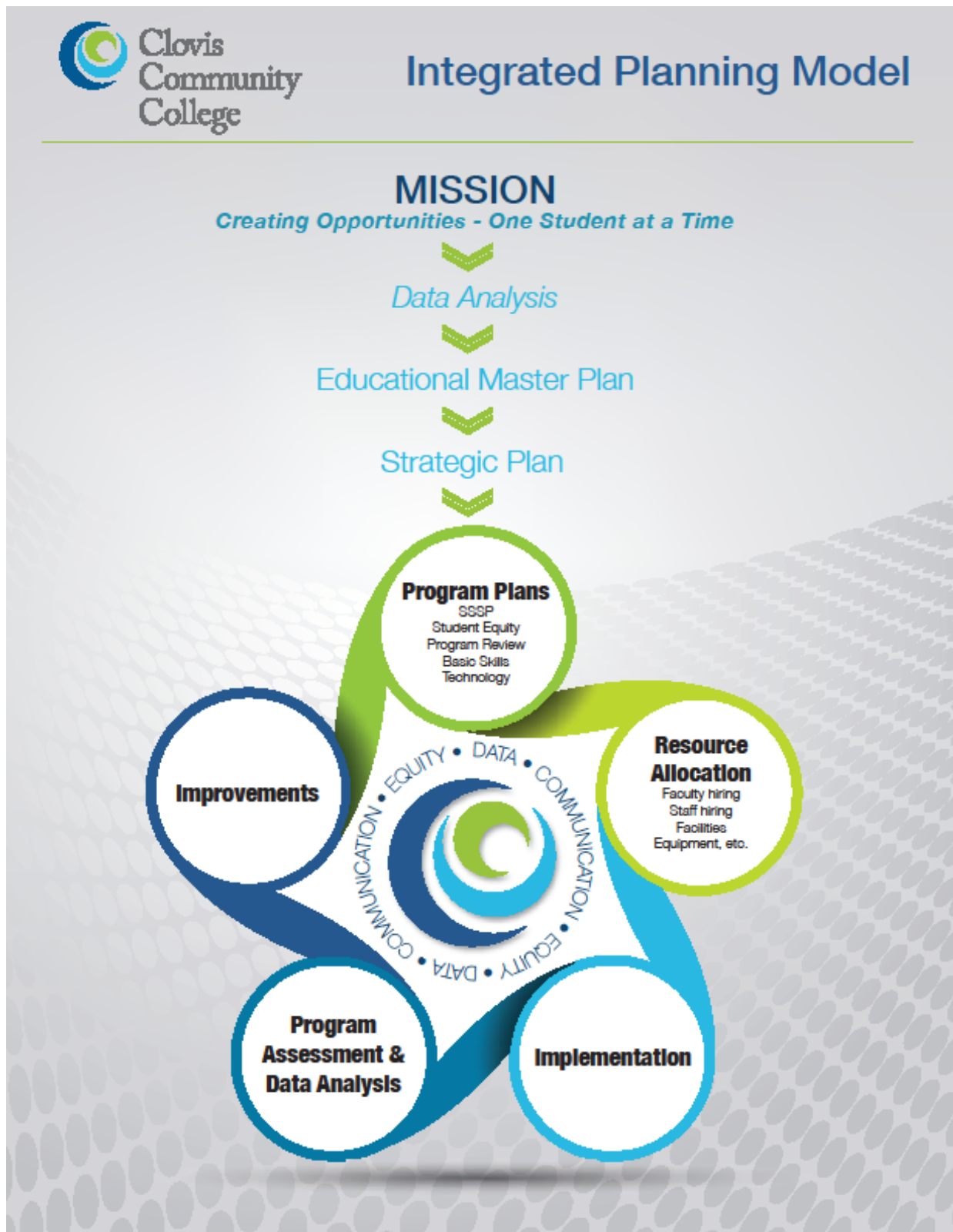
Integrated Planning Model (Figure 1)