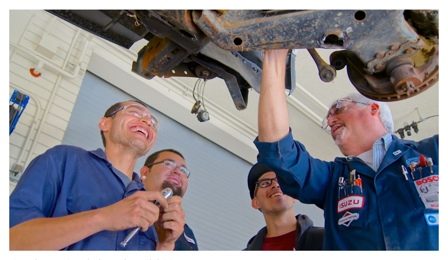
Rio Hondo Automotive Technology students with their instructor.