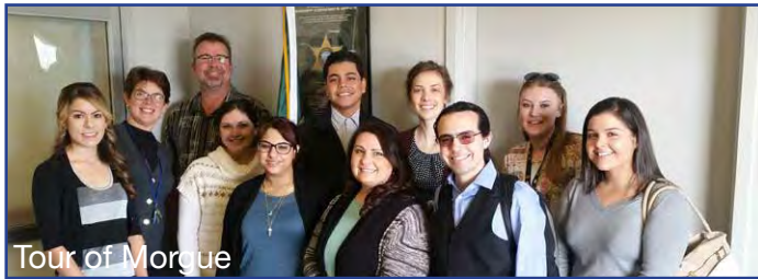
Tour of Morgue

CCC Pre-Professional Health Club visits the Fresno County Morgue on February 19: Students had an opportunity to observe an autopsy from start to finish! The physician who conducted the autopsy walked the group through the entire procedure, answered questions, and quizzed the students. Everyone agreed that it was a worthwhile experience and the students are very grateful to the Fresno County Sheriff's Department for allowing the students access to their facility. Two other trips are planned for this semester.