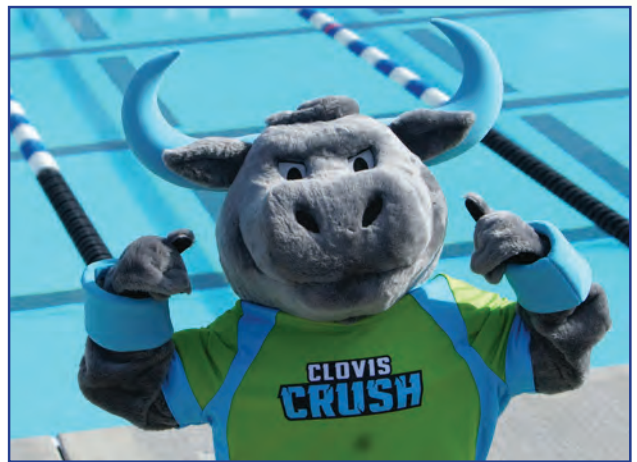
At our Spring 2017 festivities, we introduced our new mascot – “Crush”