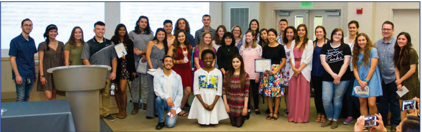
Students at our 2016 Scholarship Award Ceremony where we awarded more than 50 student scholarships