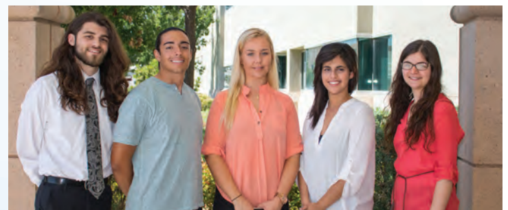
2017-2018 ASG Officers